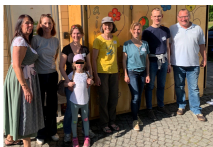
The team at the opening of the FairTeiler

There is a new FairTeiler for groceries at Solothurner Straße 93.