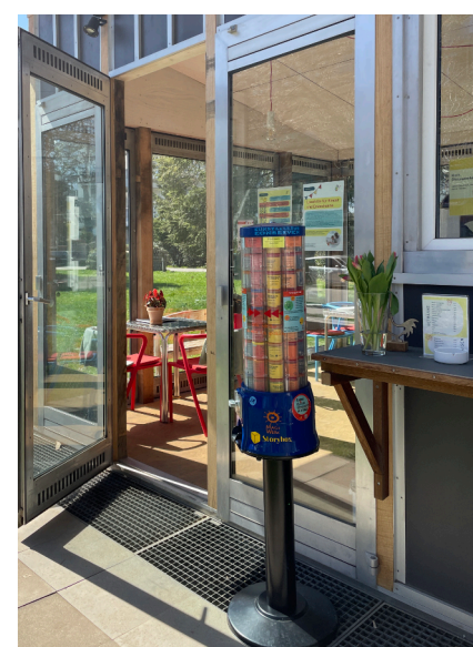
Culture Cans vending machine is at the kiosk

Art in small doses - the vending machine at the “Zur FÜRstin” kiosk and its many contents invite you to join in and experiment.