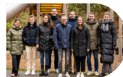
A LIVELY NEIGHBOURHOOD: NEIGHBOURHOOD PROGRAM

Welcome to the FÜRstenried West neighbourhood! We take care of your concerns and are always available to answer questions and provide help if needed assistance. We are proud to be part of the FÜRstenried West neighbourhood and look forward to getting to know you.