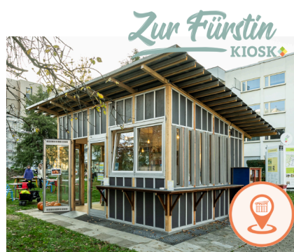
KIOSK ZUR FÜRSTIN

Have you already discovered the new offers in the FÜRstenried West neighbourhood? The map gives you an overview of where you can find the book exchange shelf, the garden islands, the neighbourhood meeting place or our new kiosk. We hope you enjoy exploring!