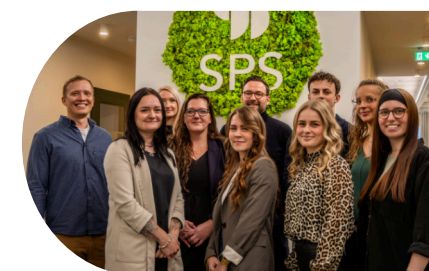
DIGITAL OR ON SITE: YOUR PROPERTY MANAGEMENT

We, Hines Immobilien GmbH, are creating urgently needed living space for Munich on behalf of BVK. Our goal is to create an ecological neighbourhood for you with a high quality of living and quality of life, affordable and subsidized rental apartments as well as plenty of green space and a good infrastructure.