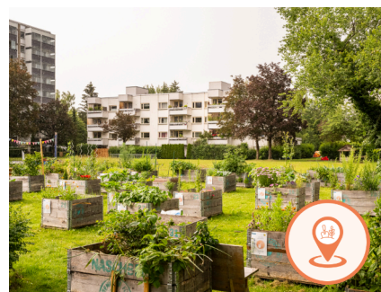
GARDEN ISLAND EAST+WEST