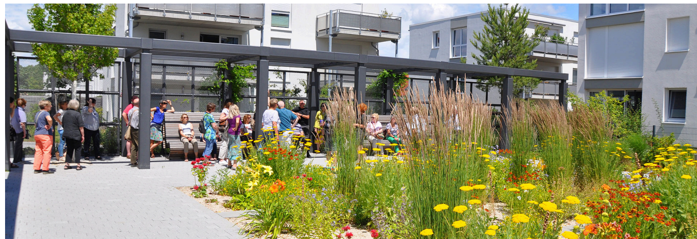
Exemplary open space concept for the neighborhood square in FÜRstenried West

In the FÜRstenried West quarter, well thought-out open space planning creates additional quality of life.