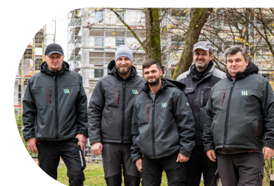
ALWAYS ON SITE: THE NEW CARETAKER TEAM

At Smart Property Management, we want you to feel comfortable in your home. To achieve this, we rely on an experienced team of specialists in property management, letting, rental accounting and utility billing. Our experts take care of all your concerns quickly and reliably - whether digitally or on site.