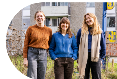
KEEPING AN OVERVIEW: THE NEIGHBOURHOOD MANAGEMENT

We, the architecture and urban development office STUDIO | STADT | REGION, would like to get to know you all. This year, too, we are organizing a monthly event in the neighbourhood.