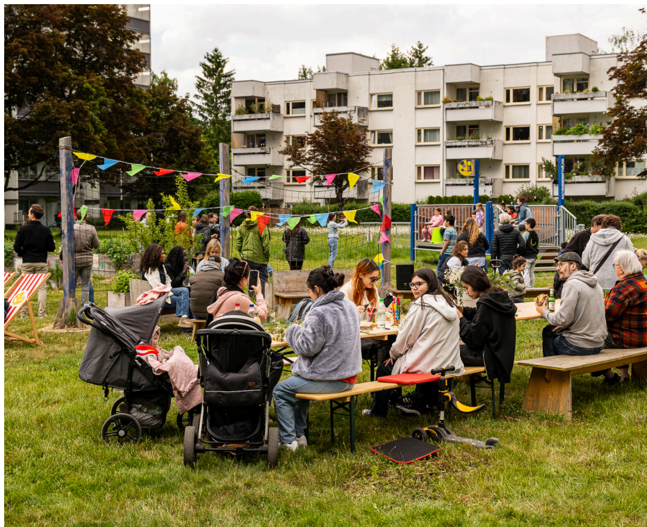
The garden festival on the Garteninsel with food truck, flower wreath making and children's program