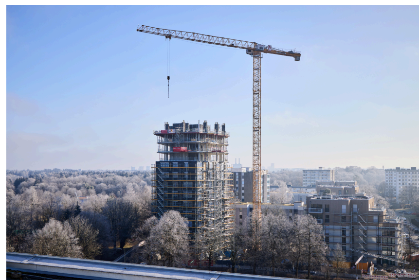
House Rotondo (new building) and Gino (extension) at the end of Appenzeller Strasse