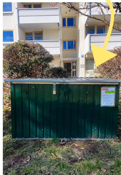
The new games box next to our kiosk

Various games are now available: A volleyball net with volleyball, skate ramps, a soccer, skipping ropes and other outdoor games that can be borrowed free of charge. Would you like to borrow the games? There is a combination lock on the box. Write us a short e-mail and we will send you the code. Do you have games that you would like to donate to the box? Then please write to us! nachbarschaft@fuerstenriedwest.de