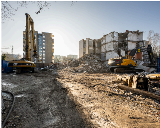
An insight into the work

Construction progress in the quarter will continue as planned in 2025. The demolition work at Forst-Kasten-Allee 125 is almost complete and the tower with integrated daycare center is entering the construction phase. The first new timber-hybrid building with 18 subsidized apartments is completed. Important milestones are on the horizon, including the completion of several shell buildings and the start of the first energy-efficient refurbishments. The neighbourhood keeps moving!