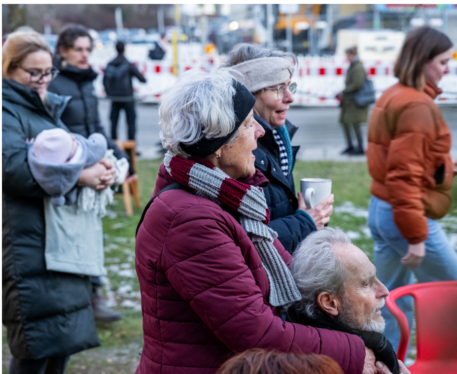
The „Gitarrenonkel“ gave a great concert in January

More information under: WWW.FUERSTENRIEDWEST.DE