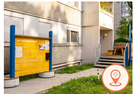
NEIGHBOURHOOD MEETING PLACE

There are three different themed areas: Bee Playground, Water Playground and climbing playground. Here your children can let off steam undisturbed. On your marks, ready, set, go!