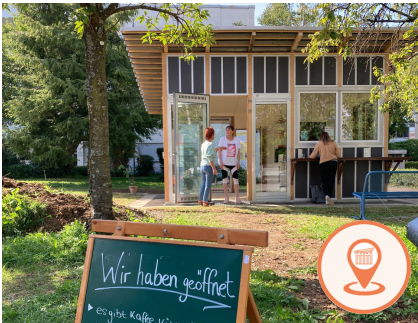
KIOSK ZUR FÜRSTIN