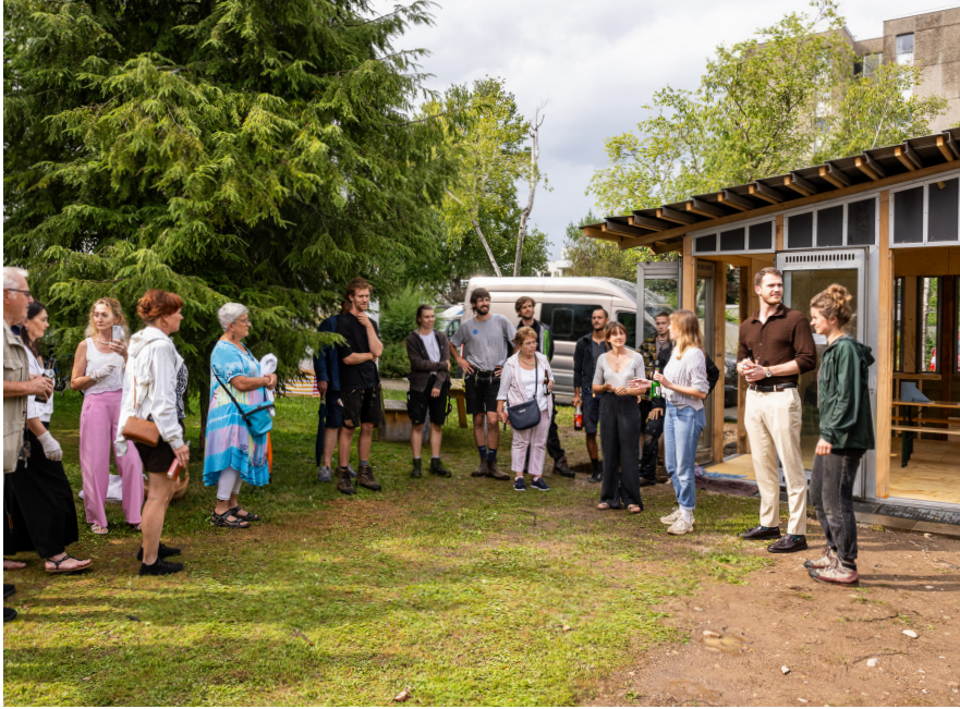
The new kiosk in FÜRstenried West was officially opened on 8 th of August