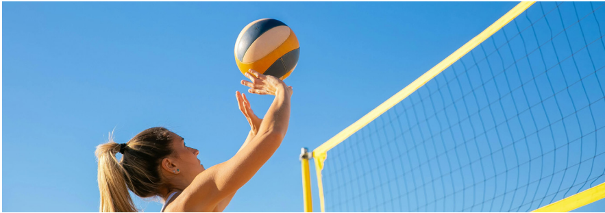
A volleyball court and skate ramps were selected

The neighbourhood submitted project ideas. We have selected the best project ideas and they will be implemented in the FÜRsternied West neighbourhood in the near future.