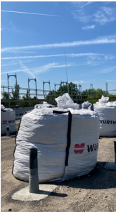
ROOF GRAVEL THE FOUNDATION