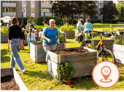
GARDEN ISLAND WEST + EAST