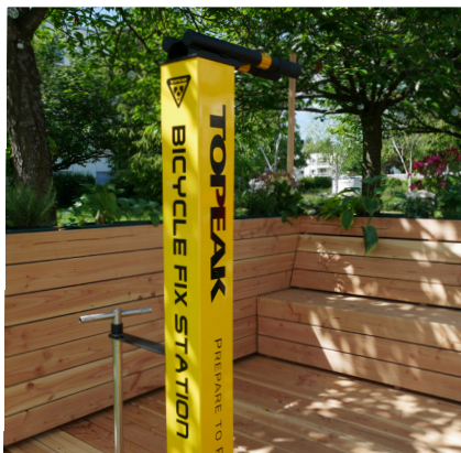
Bicycle repair station at Appenzeller Street 127

One of the highlights is the new bicycle repair station at Appenzeller Street 127, right next to the existing mobility station for cargo bikes, where you can now carry out small repairs to your bicycle yourself. The station is not only functional, but also offers cosy seating that invites you to take a break and have a chat.