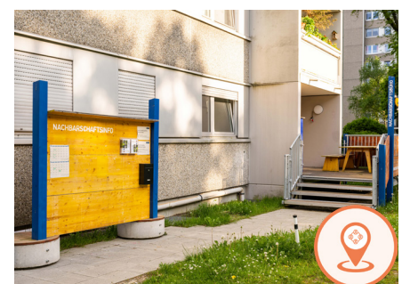
NEIGHBOURHOOD MEETING PLACE

There are three different themed areas: Bee Playground, Water Playground and climbing playground. Here your children can let off steam undisturbed. On your marks, get set, go!