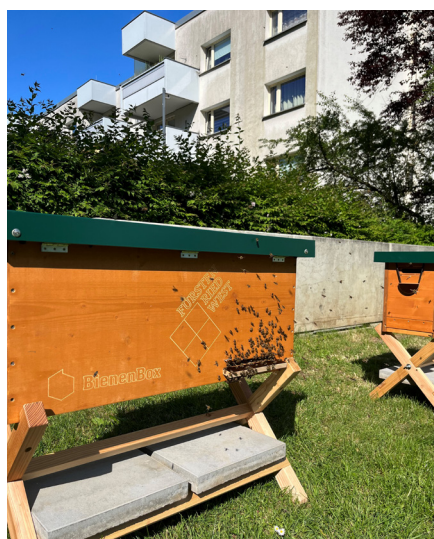
Two new beehives in the neighbourhood

We would like to introduce you to your new little, furry neighbours: since this year, bees have also been living in two hives in the FÜRstenried West neighborhood. In cooperation with the organisation Stadtbienen GmbH, honey bee colonies find a - rent-free - home in our neighbourhood. Bee welfare is particularly important to us, which is why honey bees are kept organically. This means that the bees build their own honeycombs, reproduce through swarming and overwinter on their own honey. We only remove the excess honey.