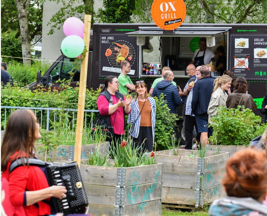
This was our garden party at Garteninsel West