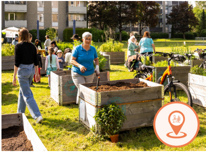
GARDEN ISLAND WEST + EAST