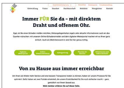
New subpage "Contact"

Visit us at: www.fuerstenriedwest.de/service-kontakt