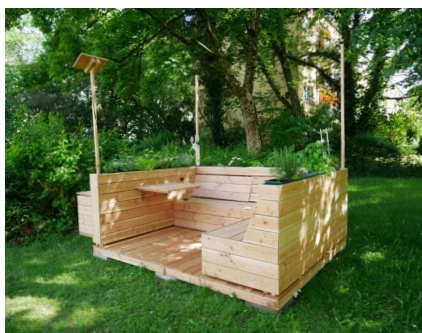
Seating area at the playground at Bellinzona Street 7

Another gem is the cosy seating area at the playground at Bellinzona Street 7, which is equipped with a table and a solar-powered charging station for mobile phones, making it an ideal place to relax and linger. Parents and grandparents can relax here while the children play nearby. This new seating area provides a valuable meeting point in our neighbourhood.