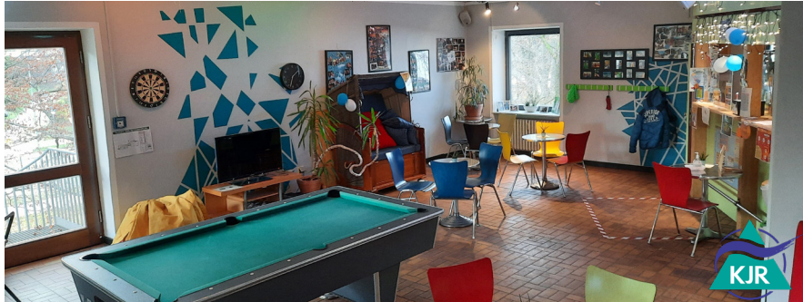
Graubündener Str. 100, 81475 München

Intermezzo is a children's and youth centre run by the Munich District Youth Council and is open Monday to Friday to anyone aged between 8 and 18. Intermezzo has several focal points: On the one hand, there is the public youth café with many leisure activities, project programmes and advice for visitors. During the school holidays, the wide range of activities on offer includes various leisure destinations and educational adventure tours in and around Munich. The open all-day school (OGS) takes place four times a week in the house - after registration - with lunch, homework supervision and leisure activities on the programme. Attached to the main centre is "The Workshop" with its creative activities: Here students can take part in courses