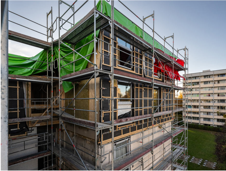
Vertical timber-hybrid extension in the construction process