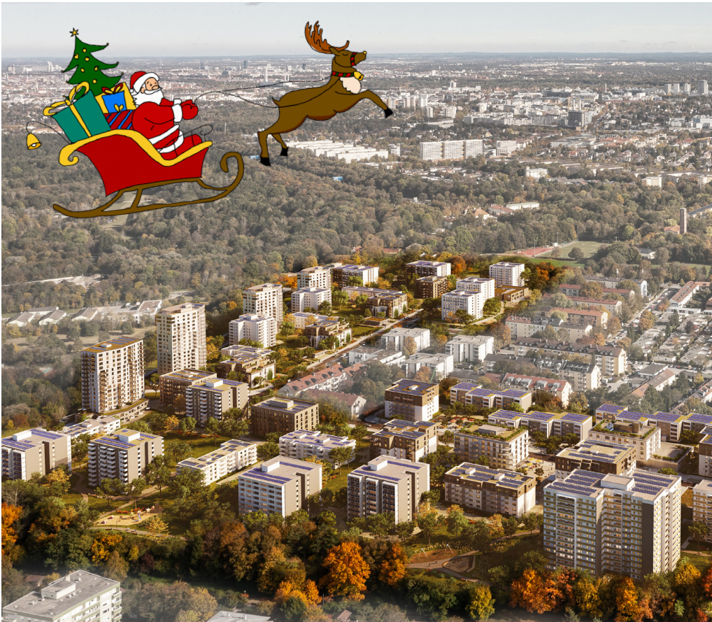
Aerial photo of the new FÜRSTENRIED WEST district in the autumn colours