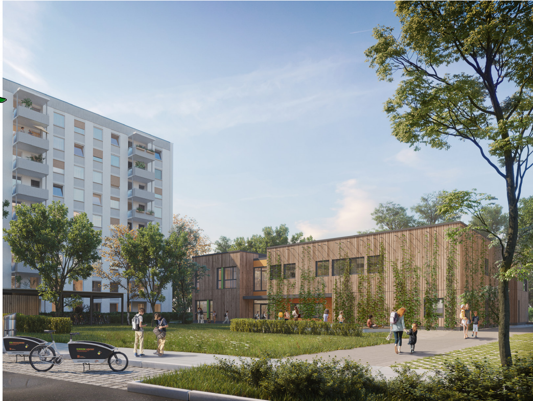
New kindergarden at the end of Bellinzona Straße