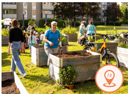
GARDEN ISLAND WEST + EAST