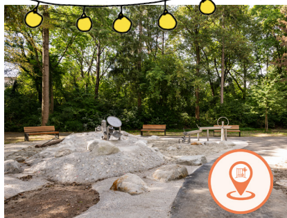
PLAYGROUNDS ARE OPEN

Have you already discovered the new facilities in the FÜRSTENRIED West neighbourhood? The map gives you an overview of where you can find things like the book exchange shelf, the garden islands, the neighbourhood meeting point or the new information boards. We wish you lots of fun exploring!