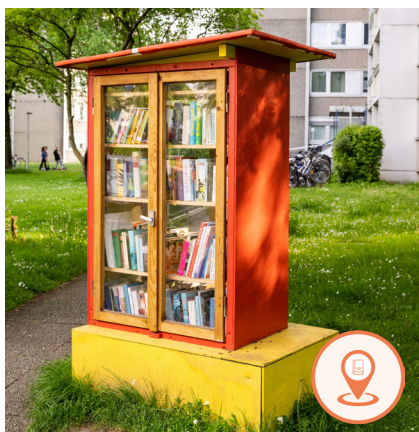
BOOK EXCHANGE SHELF