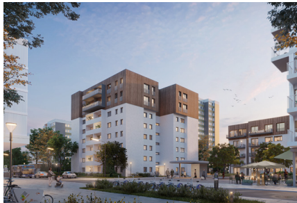
Planned storey extensions at the quarter square

There will be a lot going on in our neighbourhood next year. In addition to the ongoing progress of the current construction, these include additional floors and the start of construction on our neighbourhood pavilion. These developments will create a vibrant neighbourhood.