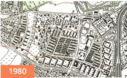
Fürstenried West 1960 – 1970 – 1980

In our efforts to constantly increase living comfort for you, we are planning a comprehensive digitization of washing machines throughout the neighborhood. To this end, we have made use of WeWash's expertise. Last year, we were already able to successfully digitally convert the first machines. With the practical WeWash app, washing times can be conveniently booked and canceled again if necessary - gone are the days of waiting for a free machine.