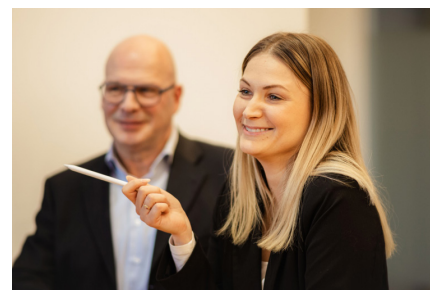
ACKERMANN Property management: We are the concerns of all tenants