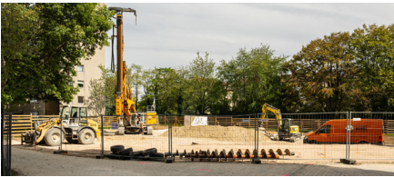
Baufeld: Haus der Kinder

After an intensive planning phase, the first construction measures in our neighborhood started in July 2023. This is made clear by the erected containers; construction fences and various other construction signals visible. This progress brings us closer to our goal of creating urgently needed living space for Munich. During the first construction phase, a wide range of housing concepts will arise. .