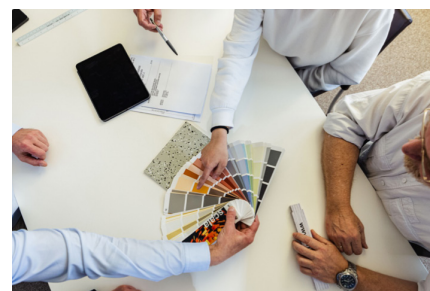
ACKERMANN Construction Management: Your competent partner for renovation and modernization.