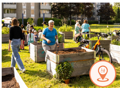
GARDEN ISLANDS WEST + EAST