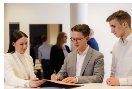
ACKERMANN Real Estate: When it comes to renting the satisfaction of all is close to our hearts.