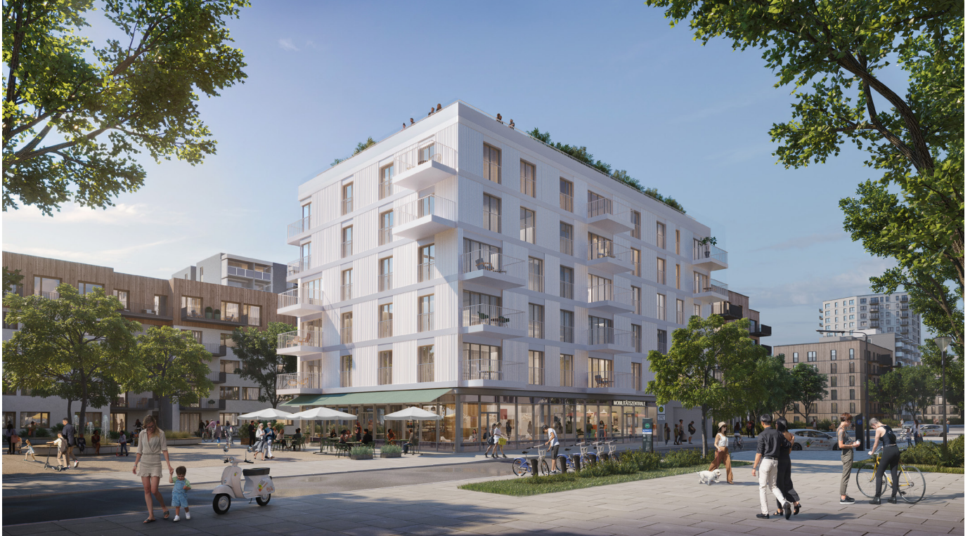
Planung: Zentraler Quartiersplatz West mit Café, Nachbarschaftstreff und Mobilitätszentrale