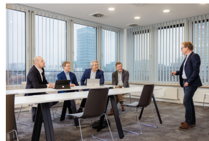
ACKERMANN Group: Experience and quality united under one roof.

In this way, the various departments work hand in hand every day to cope with the tasks that arise in the neighborhood and create added value for the community and future tenants. The entire process, from leasing to management, is thus managed under one roof, always with the aim of residents of the neighborhood as simply and as easily and comfortably as possible.